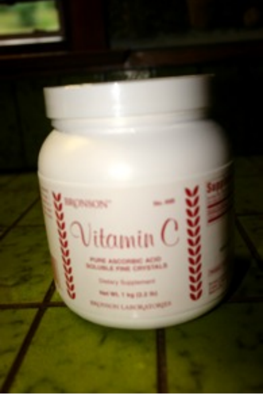
Figure 29. Bronson Laboratories Vitamin C

I also recommend putting together a comprehensive home medicine kit by purchasing the nonprescription components listed in the book. Then immediately prior to a crisis, visit your doctor and obtain prescriptions for the rest.