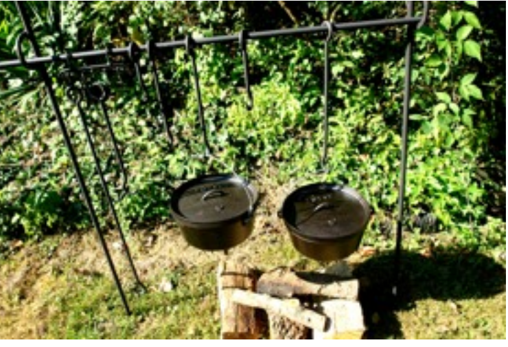
Figure 14. Campfire Cafe, Cowboy Cookware by Johnny Mix

This Volcano cook stove is designed for use with cast iron Dutch ovens. It runs off from charcoal, wood or propane. It is nice to find a small portable stove that is designed to operate using firewood. It will even run on twigs and branches. This unit is also very portable. Pull on handle and it unfolds in the middle and the legs