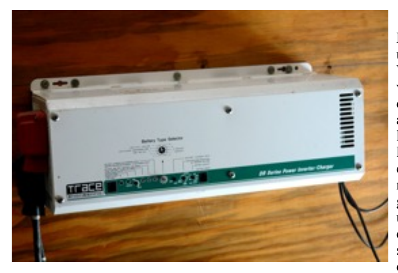
Figure 28. Trace Power Converter/Charger