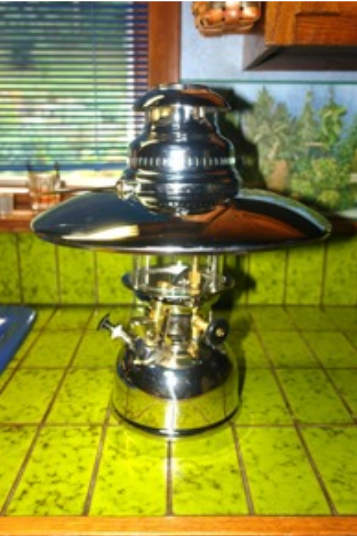
Figure 19. Petromax BriteLyt Lantern, Model 500CP

I recommend combining 3 elements to meet sanitation needs. (1) There are portable toilet kits on the market today that use a 5 or 6 gallon plastic bucket with a snap on toilet I would recommend obtaining one of these. seat. An individual could fabricate one by pulling the toilet seat off their toilet and using a few pieces of scrap lumber. But these are so inexpensive, why go through the trouble. (2) In the 1850s, a recycling "earth toilet" was as American as apple pie. It consisted of a seat placed over a container filled with dry earth. After each use, more dry earth was piled into the container. Instead of throwing away the waste in the container, farmers put it to use in agricultural fields as compost. I would recommend that during this