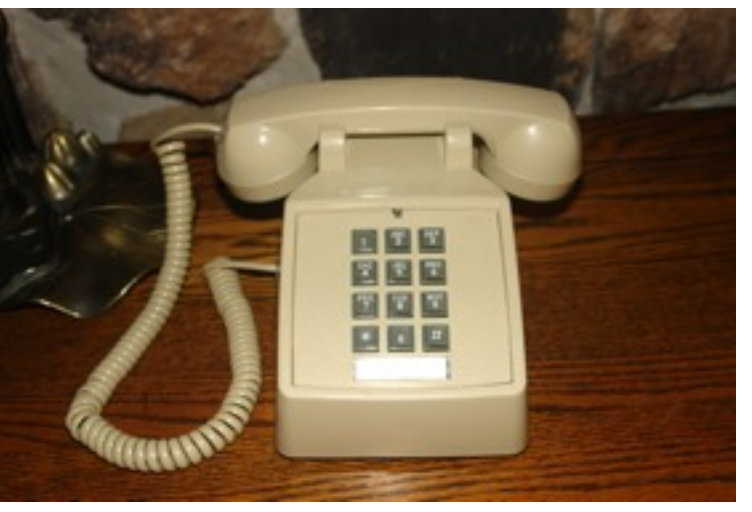
Figure 31. SciTec AEGIS 2510D Desk Phone

3. Landline Telephones – For those who are too young to remember or know, in the old days, telephones were at least as large as size 8 shoes, and they were tethered to telephone wall jacks by telephone cables. The vast majority of those phones got their power (Direct Current) through that telephone cable, and the telephone company had its own backup power. I recommend that individuals keep one old-