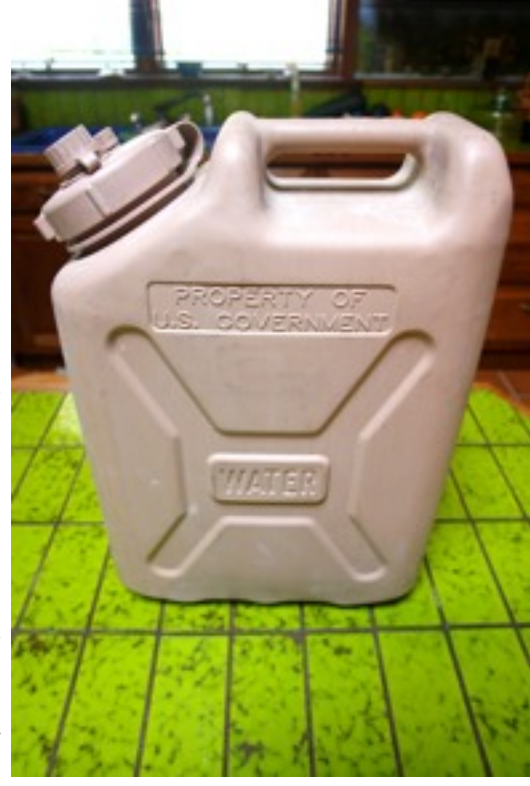
Figure 2. 5-Gallon Water Container

The most common means for storing emergency water in the U.S. is 55-gallon food-grade plastic drums. Refer to Figure 3. There are two types; one has an open head design with a removable top secured with a ring clamp, the other has a closed head. Either type is workable. Some individuals will store water year round. They fill up these drums with water and treat it with chlorine for long-term storage and store it away in the basement or closet for any emergency. But if the barrels are stored outside, in an unheated garage or outbuilding in cold climates, the water can freeze and rupture the drums. Therefore it is important to protect these barrels