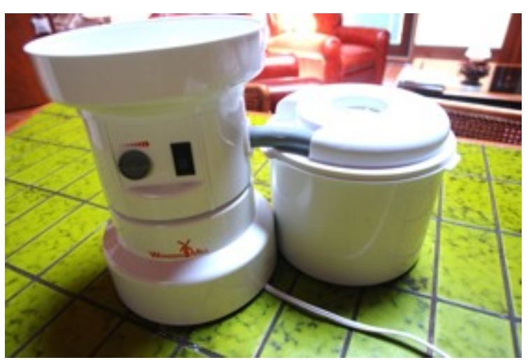
Figure 11. Wonder Mill

I enjoy making bread. Actually that's not quite true. I enjoy grinding the grain to make the bread and