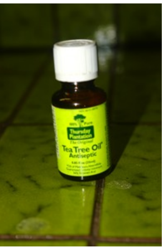
Figure 30. Tea Tree Oil

I also recommend including a bottle of Tea Tree Oil in the medicine kit. This item can be found in many health food stores. Australian aboriginals used tea tree leaves for healing skin cuts, burns, and infections by crushing the leaves and applying them to the affected area. Tea tree oil contains constituents called terpenoids, which have been