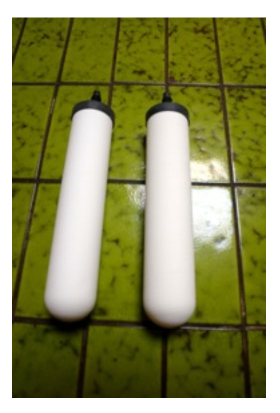
Figure 7. Ceramic Filters used in British Berkefeld

In a crisis, many individuals will not have prepared properly for their drinking water needs. Often times ground water sources and tap water sources will become polluted, which can lead to sickness, disease and the potential for epidemics. Ceramic water filters are expensive and few members of our society will have the foresight to purchase one. I felt there has to be a better means to filter drinking