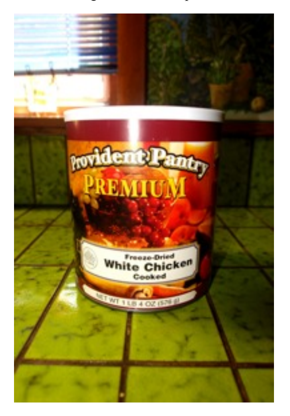
Figure 9. Freeze Dried Chicken

www.BePrepared.com is a good source. Send away for their catalog because I find it difficult to maneuver through their online store website. The grains I recommend are in 6-Gallon SuperPails. These grains are stored in a metalized bag to keep moisture and odors out. Prior to sealing the grains in a bag, an oxygen absorber is inserted. Oxygen absorber packet chemically bind and remove oxygen from inside the bag. Air contains about 78% inert nitrogen and 21% reactive oxygen, leaving about 1% for the other gasses. The oxygen is absorbed, leaving about 99% pure nitrogen in a partial vacuum. This will keep the grains fresh for a very long time. The bags are inserted in six-gallon SuperPails. This protects the metalized bags and also keeps insects, mice and other vermin out. Food in this form stored in a cool