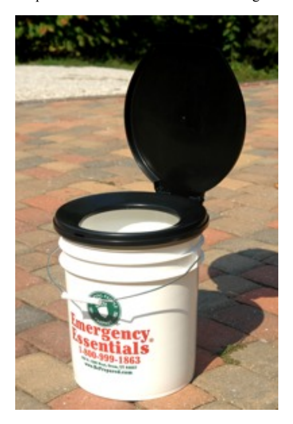
Figure 20. Portable Toilet Kit