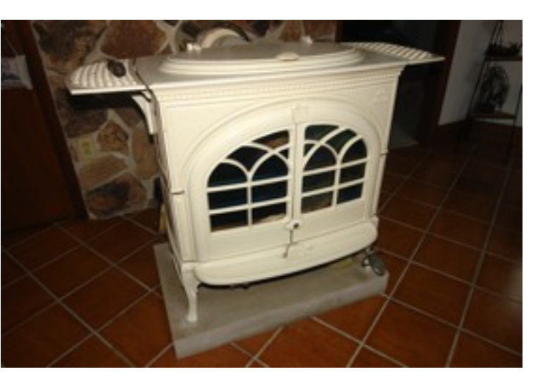
Figure 22. Jotul Firelight Model #12 Wood Stove

In areas with abundant firewood, wood stoves can be an effective backup heat source. For many individuals, a space