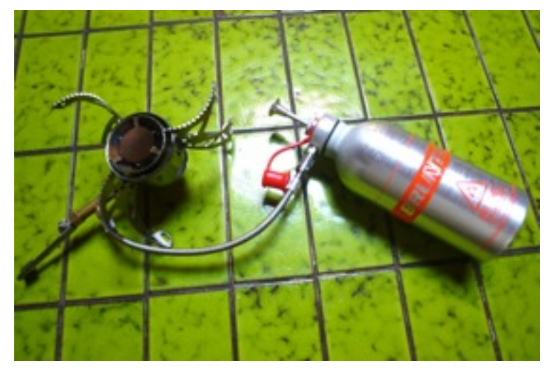
Figure 13. Collapsible Optimus Nova Stove by Brunton

come out and lock into position. Lift by the bottom and it folds up for transport almost like magic. <u>http://www.aaoobfoods.com/</u> volcanostoves.htm#top