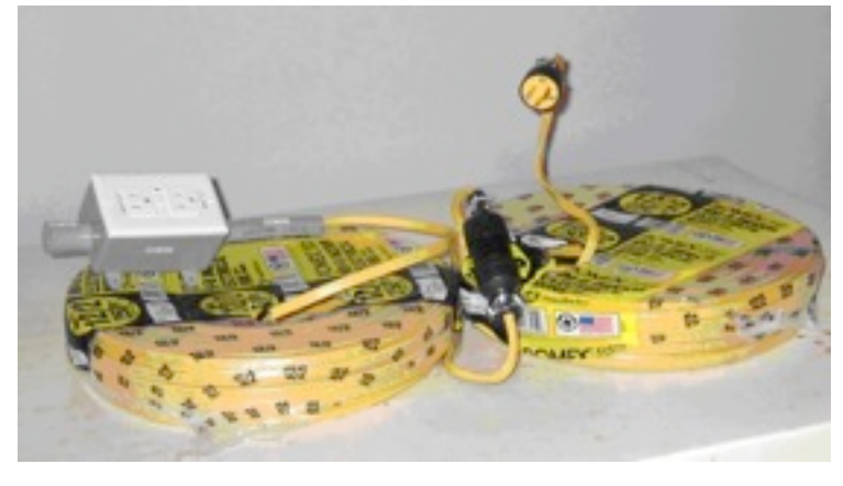
Figure 26. Two Extension Cords 120 Volt, 250 Feet Each

long using normal 12/2 household wiring. This allows me to put power wherever it is needed with minimal line loss. Refer to Figure 26. All these tasks should be done prior to the crisis because chasing around town during a disaster trying to find critical parts or expertise is a disaster, and definitely not good disaster preparedness. The final step is to purchase a dozen 5-gallon plastic fuel cans. You should have some indication that a massive solar storm is about to hit. When you get the warning, immediately fill up