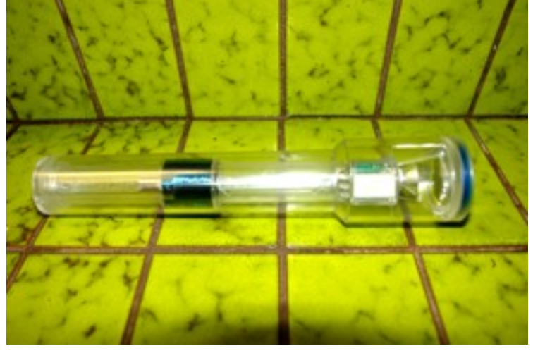
Figure 18. NightStar Flashlight

LED. Shaking the flashlight for 30 seconds provides a full 20 minutes of useable light. The flashlight