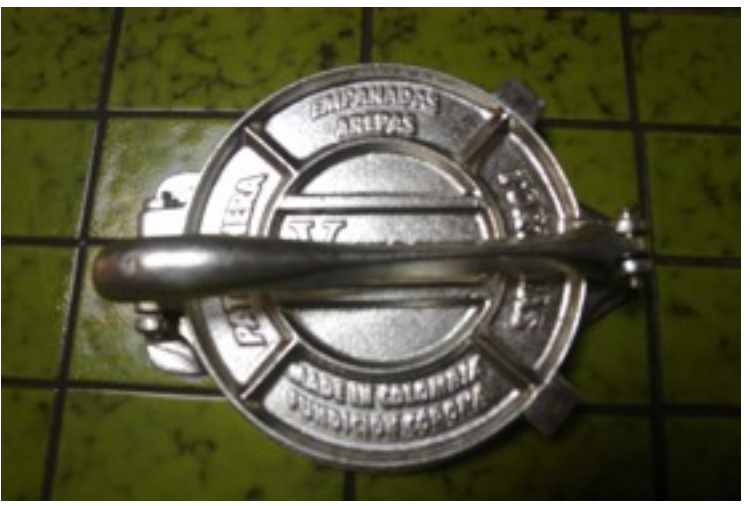
Figure 16. 8-inch Victoria Cast Iron Tortilla Press

4. Tortilla Press – A tortilla press is very handy in making tortillas that look like