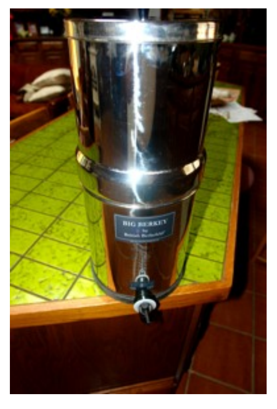
Figure 6. British Berkefeld, Model SS Big Berkey