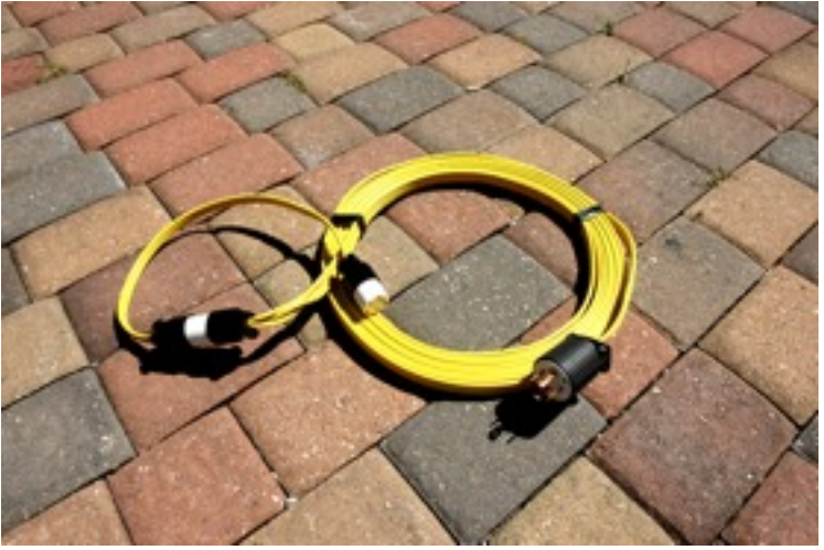
Figure 25. Extension Cord for 220 Volt Water Pump

to Figure 25. The third step is to purchase a general purpose long (100 foot or greater) heavy duty 120 volt extension cord. This is to allow the flexibility to power any item in your house even at its farthest reaches. Ι recommend a grounded 12-gauge extension cord for minimum voltage line drop. These will be hard to find and expensive. But they are available for purchase. It is possible to string a number of shorter and thinner gauge extension cords together but thin cords will not carry the load and each connection you add will rob you of valuable electrical power. If you have electrician knowledge and expertise, you might even make some up. I put together 2 extension cords each 250 feet