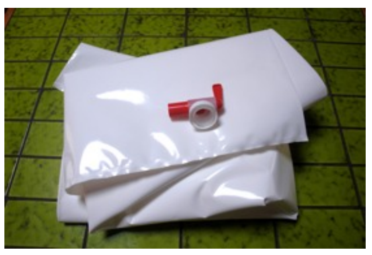
Figure 4. 200-Gallon Aquatank Water Storage Container

from extreme cold. Others will store the barrels empty and fill them as an emergency approaches. If you purchase a closed head barrel, I would recommend you also purchase a hand operated water pump stroke such as the Rieke Corp MR50XL to make it easy to extract water from the barrel. Another type of storage is an Aquatank water storage container. Refer to Figure 4. This photograph shows a 200-gallon water containers, 4' x 8' in size; one that fits on the bed of a pickup truck. It gives the ability to drive to a