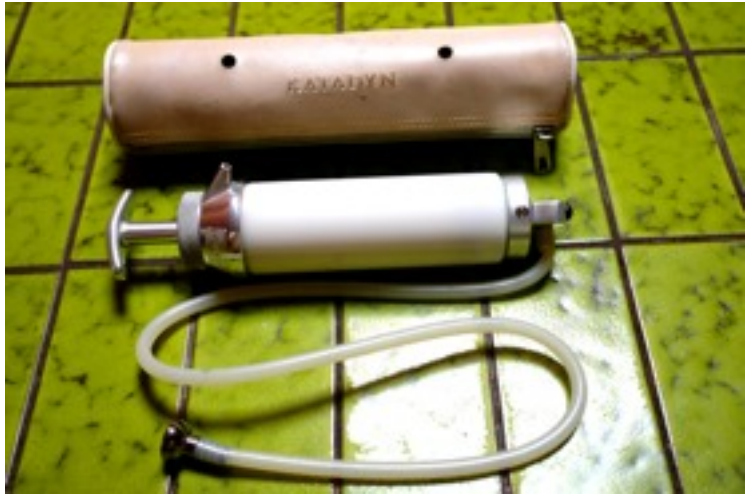
Figure 5. Katadyn Pocket Filter

Big Berkey is a gravity fed water filtration system. It uses 4 ceramic filter elements that reduce 99.99% of particulates, cysts, parasites and pathogenic bacteria from water. It will process 21 gallons of water per day. Figure 6 is a photograph of Big Berkey and Figure 7 shows the ceramic filters used in this system.