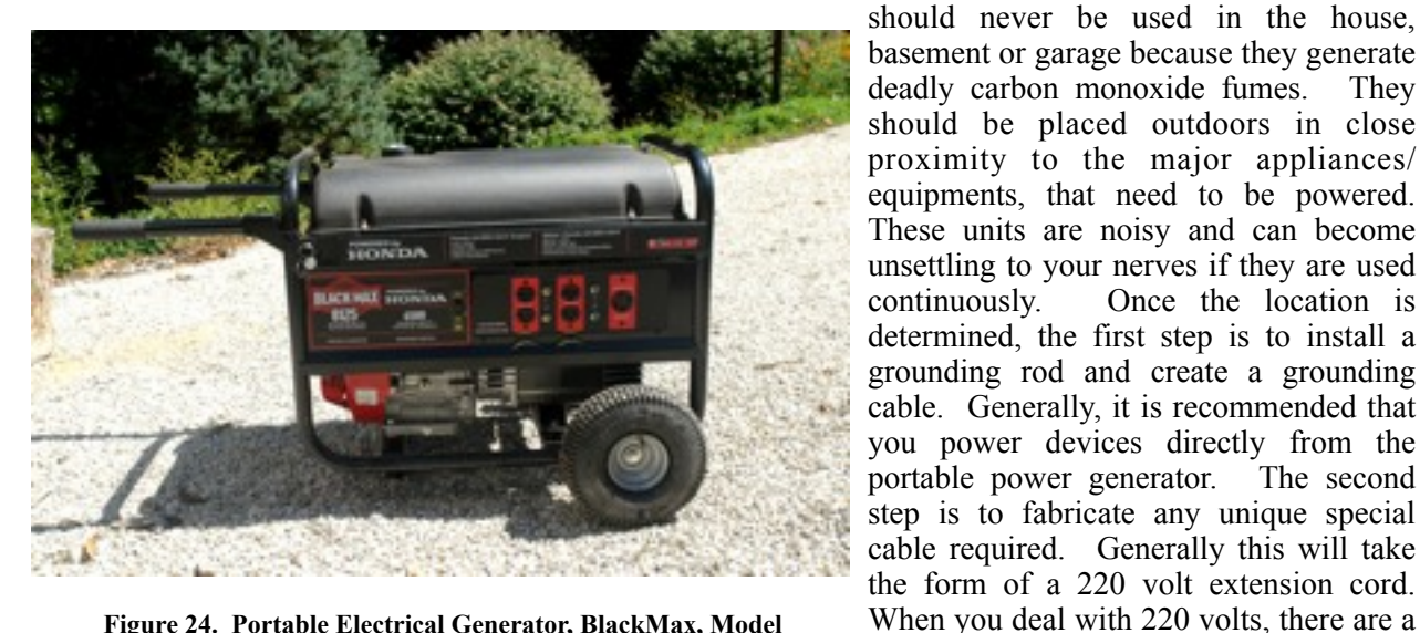
Figure 24. Portable Electrical Generator, BlackMax, Model PM0496500, 13 HP, 6500 running watts, 8125 max watts

After buying the portable generator, there are several tasks that should be done prior to any emergency. First determine where you will place the generator during operation. These generators should never be used in the house,