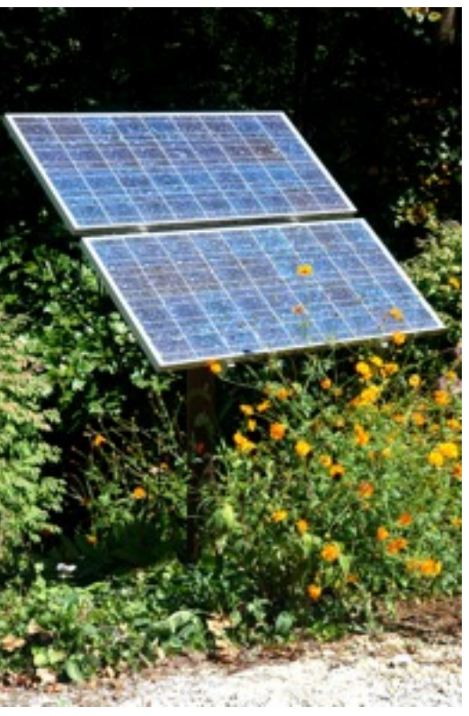
Figure 27. Kyocera Solar Panels