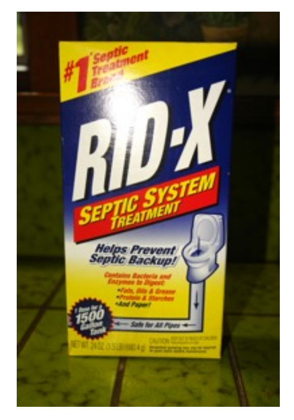
Figure 21. Rid-X Septic System Treatment