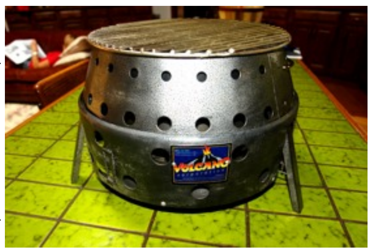
Figure 12. Volcano II Collapsible Stove, Model Number 20-200

Cooking Stove - I have heated my 2. home solely with firewood for 30 years. I have tens of thousands of trees on my 30 acres. I have an ample supply of firewood at my disposal. Therefore in this type of disaster, I would turn to wood as my source of fuel for cooking during this type of emergency. In constructive emergency planning, everyone should give some thought to the question of a backup cooking source. Most individuals have backyard grills, but how long will the charcoal or propane tanks last. And then what? Some individuals live in areas with abundant firewood, other in areas of abundant coal. These are good long-term sources of cooking fuel. Some areas have