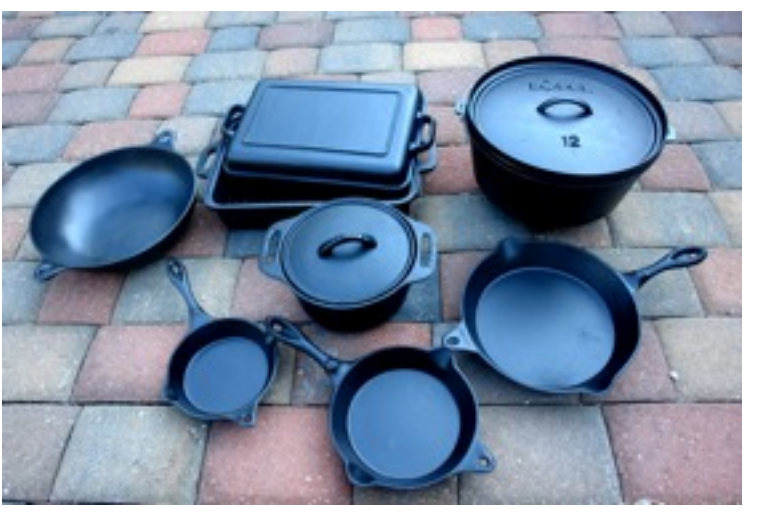
Figure 15. Cast Iron Cookware

Mayflower pilgrims set foot on our shores. Through the years; colonials, explorers, mountain men, settlers, cattlemen, loggers, and gold miners have relied on them for cooking their meals. This black ironware has been extensively used and highly regarded. It is also fairly inexpensive. At the heart of this cookware is the "Dutch Oven". This is outdoor camp cookware. For those that have ready access to firewood, this type of cookware can be ideal for surviving a major disaster. This type of cookware requires seasoning prior to its first use, so carefully read the instructions before its initial use. This seasoning is normal done by rinsing in hot water (not using soap) and then immediately drying and then applying a thin coat of vegetable oil (for example,