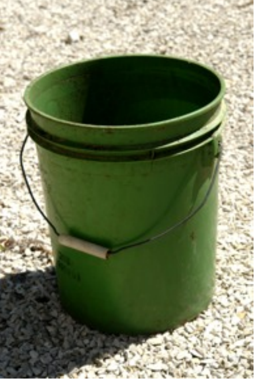
Figure 32. Five Gallon Heavy Duty Buckets

For those individuals that need the security of storing gasoline over months and years, look up the product called "STABIL". It is an additive found in auto parts stores that stabilizes gasoline and keeps it fresh over the winter.