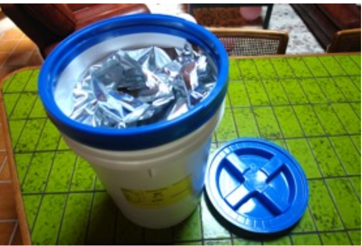
Figure 8. 6-Gallon Superpail of "Spelt", Gamma Lid Removed

Individuals and families should store some food for whatever disaster might come their way. What amount should be stored? I feel a three-month supply is about the right amount. This provides a buffer time. What form should the food storage take? Shelf life is a major issue. Many forms of food storage have short shelf lives and require a meticulously tracking and food stock rotation program. For that reason, I recommend storage of basic food staples in the form of dried wheat, rice, beans and other grains and legumes. Refer to Figure 8. Essentials Emergency a t