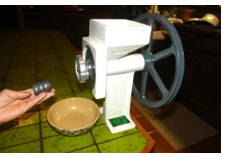
Figure 10. Country Living Grain Mill

Wonder Mill is an electric grain grinder. It requires electricity to operate, but if you have access to a portable generator, the mill can grind around 10 cups of wheat into flour in