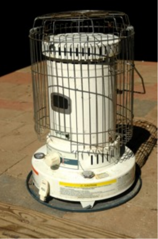
Figure 23. Dyna-Glo 23,000 BTU Portable Kerosene Heater, Model RMC-95C

1. Emergency Electrical Generator – If you live in a house, a portable emergency electrical generator may be an important tool during an extended power blackout. Before you make that decision, analyze your basic needs. In my case, for example, I have a well and with a portable generator, I could supply my family with clean drinking water during the entire crisis. I would only need to power the water pump for about 10 minutes two or three times per day. This analysis will determine the type of electrical power (voltage/current) that is needed. I reviewed the manual that came with the water pump. I need 4.8 amps maximum at 220 volts to power the water pump. The generator I chose provides 220V at 30 amps. So I have ample electrical power for this intermittent task.